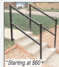
*Starting at $60*